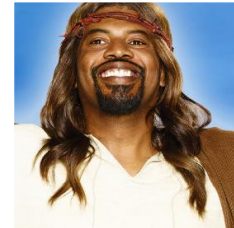
Black image of Christ