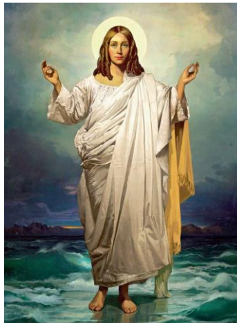
Female image of Christ

What we've done is create a list of fifteen areas of assignment which any youth in grade 8 to 12 may sign up and commit to satisfactorily complete. A youth studying for confirmation is called a "confirmand." Each confirmand and their parent/guardian must sign the "Commitment to be a Confirmand" page at the end of the booklet, tear it out and provide it to the pastor. All assignments need to be performed after the pastor receives the signed "Commitment to be a Confirmand." Each confirmand will be assigned an adult mentor for help, guidance and a new adult connection in the community and for a minimum of five meetings. Confirmands and parents/guardians are responsible for accurately keeping track of progress through the program, making sure all forms and requirements are satisfactorily completed to the pastor's satisfaction before a confirmand is invited to a meeting with the Diaconate and a confirmation ceremony.