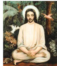
Indian image of Christ